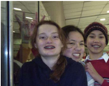
Youth enjoy a frosty time on the ice at the Ice Skating at Fairfax Ice Arena this past December 6th.